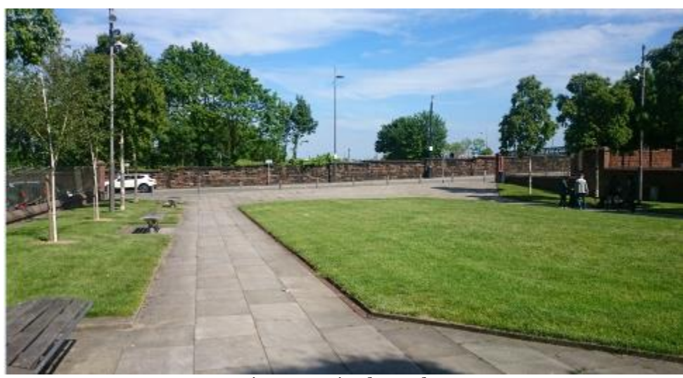
Figure 5: Friends Garden

To the east of the meeting house is the Friends Garden (Fig.5) on Shaw Street, which is now leased to the town and managed as a public park. This was once the burial ground and three flat gravestones are located to the south wall. The burial ground has a low brick wall with stone copings and metal railings. In 2010, improvements were made including landscaping and seating areas. It is now known whether burials are still in situ.