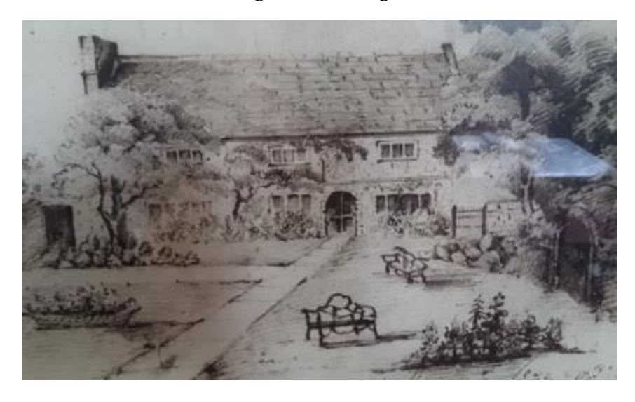
Figure 1: St Helens Meeting House drawing approx c1800

The building appears to have been built for domestic use; there is a large chimney stack with a bread oven and hidden fireplace at the west end, and there is evidence of a former first floor removed to create a meeting room (evidence for joists at west end, and the central mullioned window seen in the a drawing of c1800 (Fig.1) has since been infilled).