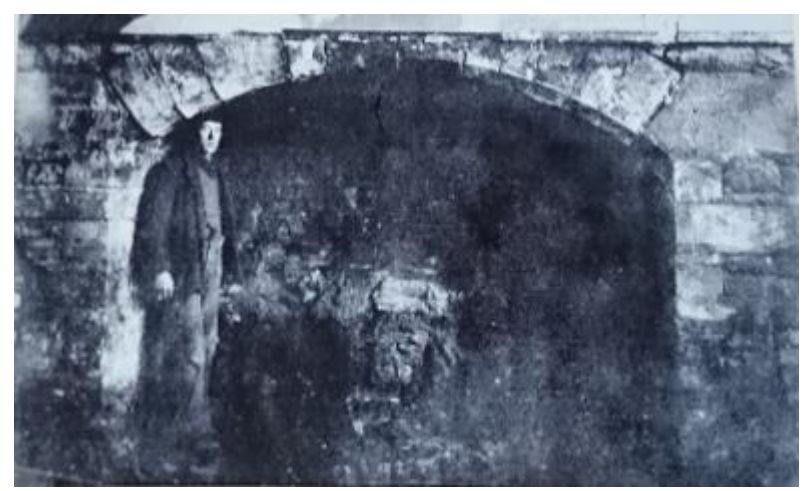
Figure 2: Fireplace on the west wall now blocked, nd

From 1773 the meeting house was in use only by the Hardshaw West Monthly Meeting whilst regular Sunday Meetings discontinued. The building was used and perhaps altered by the Presbyterians in 1863 and in 1874-5 by a Welsh congregation. The Friends began their weekly Meetings again in 1884. The sliding partition was installed after this date. It is not known when the 7ft wide fireplace (Fig.2) was first sealed to accommodate the raised stand for the Elders.