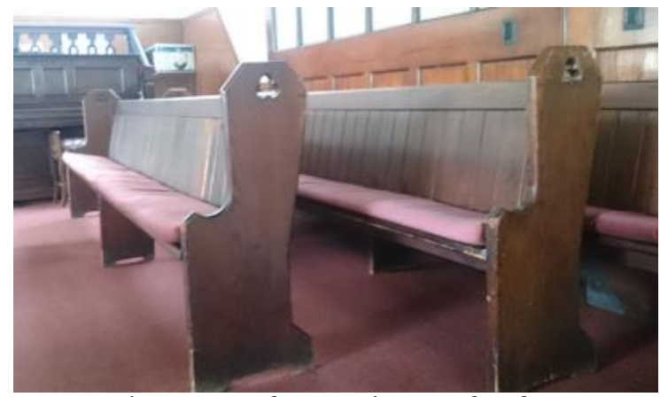
Figure 4: St Helens meeting room benches